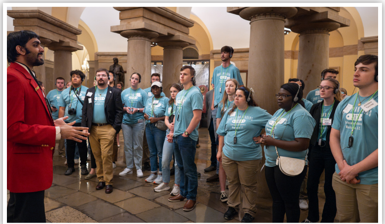
Students in the Christian Leaders Program tour the United States Capitol during LI's 2024 Christian Statesman Conference.

Your support brought back high-impact events in the program, including training and scholarships to attend the National March for Life and the capstone of the program, LI's Christian Statesman Conference.