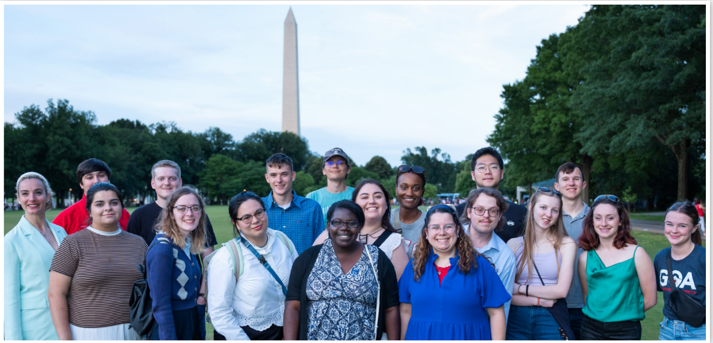
Students toured the United States Capitol and national monuments, where they discussed the important role of biblical and conservative principles in the American system of government.